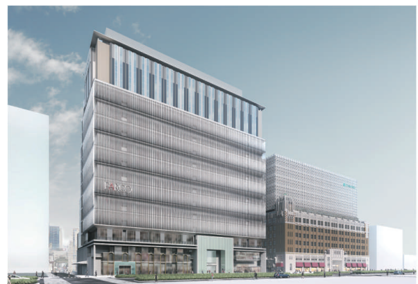
PARCO will open in the north wing in fall 2020. ©TAKENAKA Corporation