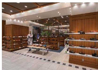
Men’s shoes department, Matsuzakaya Nagoya store

Also in the Kyoto and Sapporo stores, women’s volume zone clothing areas were reduced, and instead luxury zones were expanded to better cater to the new rich class.