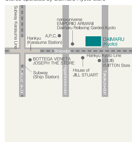
Stores operated by Daimaru Kyoto store